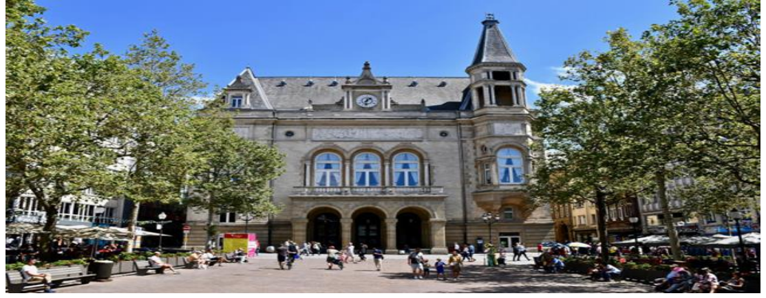
Figure 3 Place d'Armes