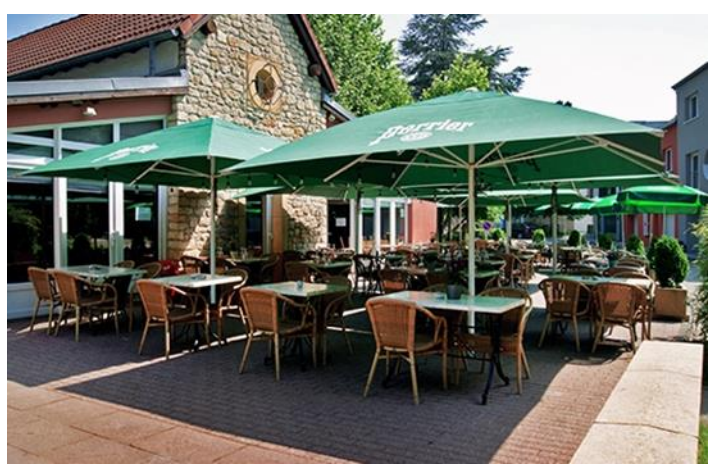
Figure6 Brasserie du Musée