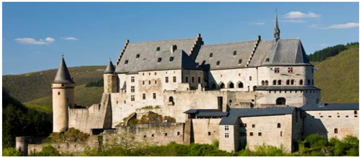
Figure 11 Burg Vianden