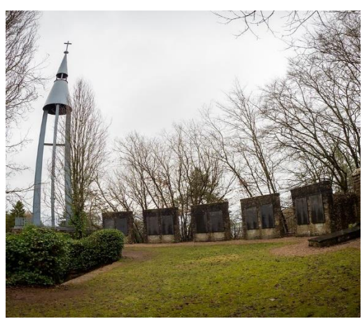
Figure 5 Nationales Bergarbeitermonument