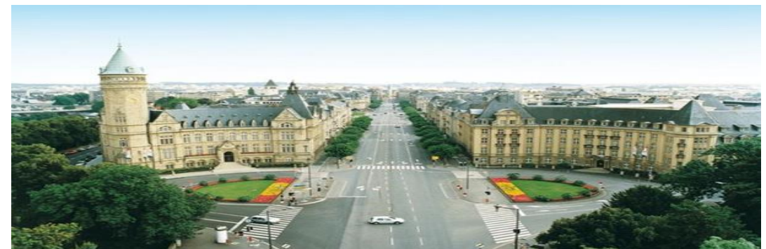
Figure 2 Avenue de la Liberté