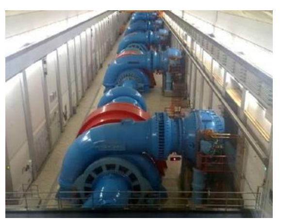
Figure 10 Turbinehallen der SEO