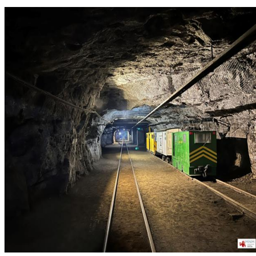
Figure 7 Nationales Bergwerkmuseum