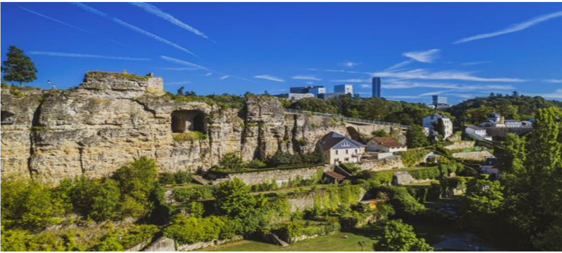
Figure 4 Bockfelsen