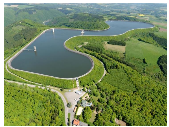
Figure 9 Oberes Becken der SEO