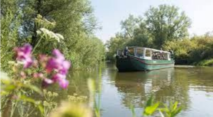
The town of Sneek Friesland